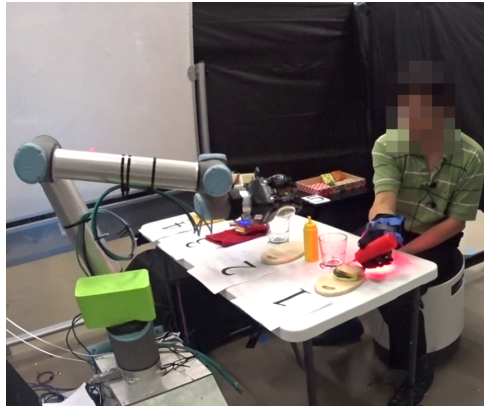
Figure 3: A human-robot team performing a shared workspace task, namely, meal preparation in a kitchen.

Procedure. Participants for the experiments were recruited on the MIT campus. The experiment protocol was approved by the institutional review board. After obtaining informed consent, participants were briefed about the collaborative robot, the safety systems in place, and the meal preparation task.